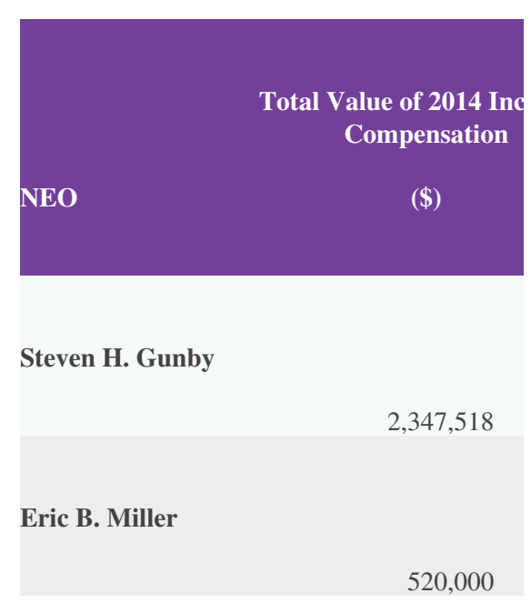
Edgar Filing: FTI CONSULTING INC - Form DEF 14A